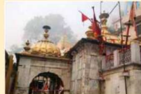
Jwala Ji Temple