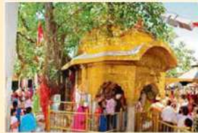
Chintpurni Devi Temple