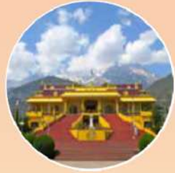
Dalai Lama Temple