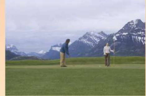
ARMY GOLF COURSE