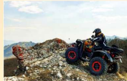
ALL TERRAIN VEHICLE (ATV)