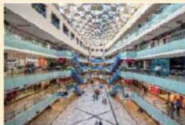
Ambience Mall, Gurgaon