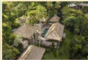
Taj S.ura Residence-Crusa Shambhala, Estado Pargasa, Goa, India