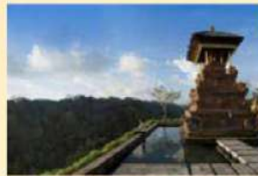
Ritz Carlton Mandapa (Reserve), Galle, Sri Lanka