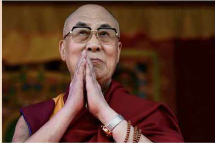
His Holiness Dalai Lama

A hub of religion and spirituality with 3 major Shaktipeeths: Chamunda Devi, Chintpurni and Jwalaji at short drivable distances from Amoha