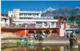
Chamunda Devi Temple