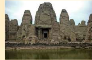
Masroor Rock Cut Temple