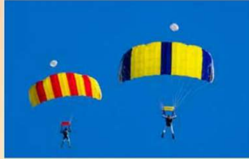
HIKING/TREKKING/ PARA GLIDING