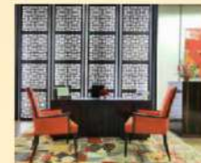
The Taj, New Delhi - All Nites, Room, 50 / 100 Restaurant