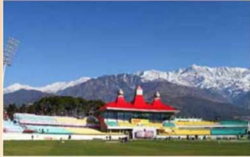
HPCA CRICKET STADIUM