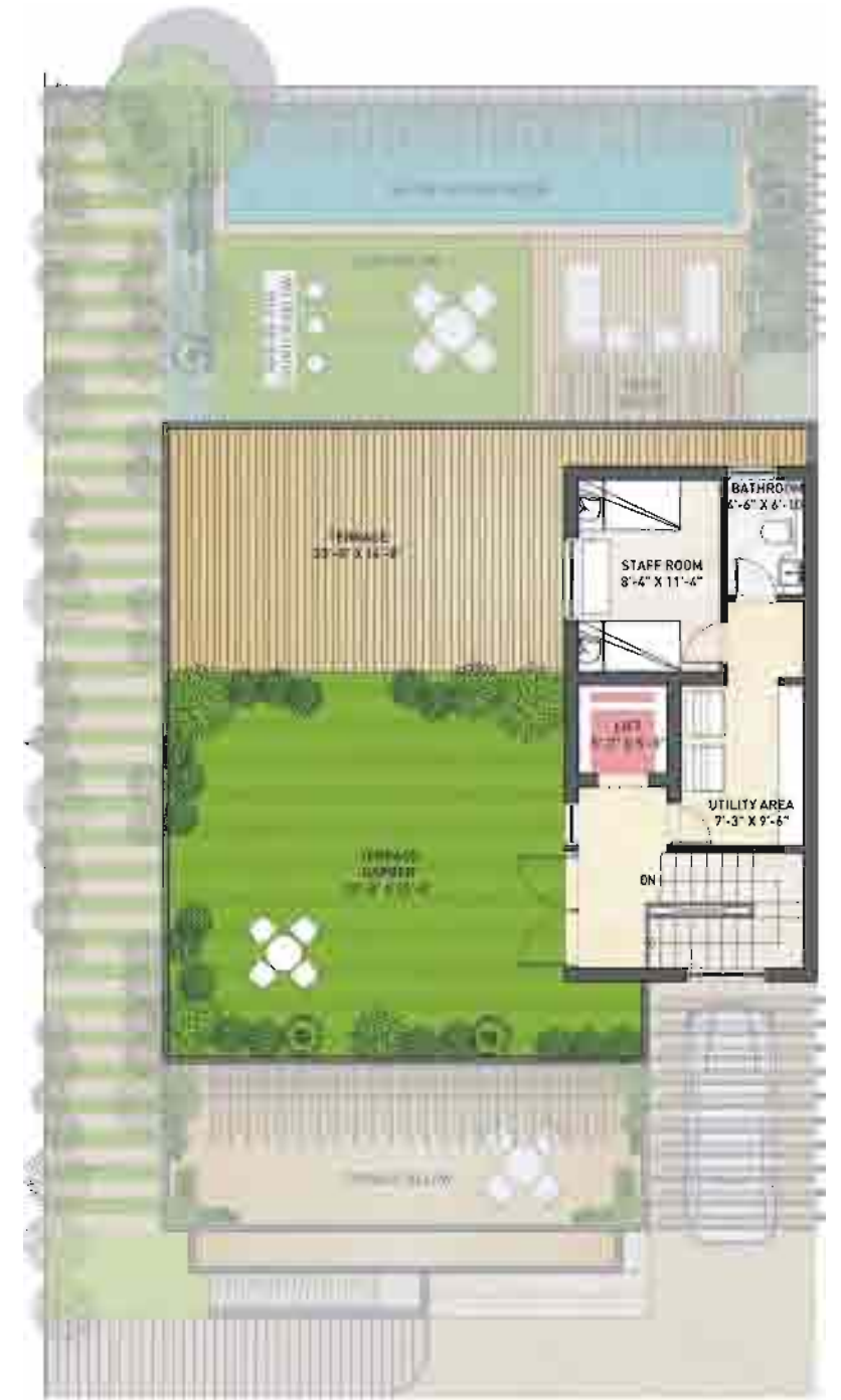
TERRACE (VILLA 1) Independent Villa, 5 BHK+S Saleable Area - 7,000 sq.ft.