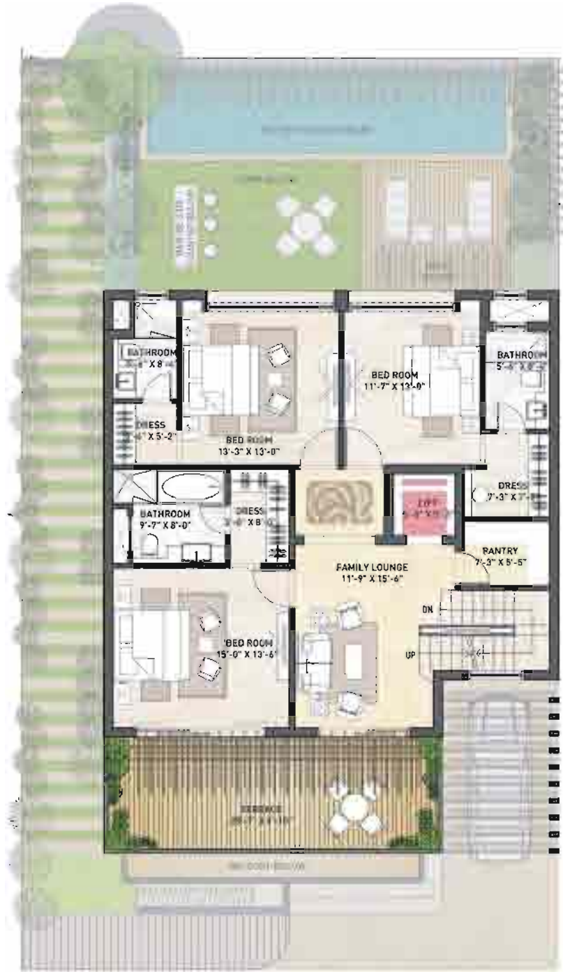
SECOND FLOOR (VILLA 1) Independent Villa, 5 BHK+S Saleable Area - 7,000 sq.ft.