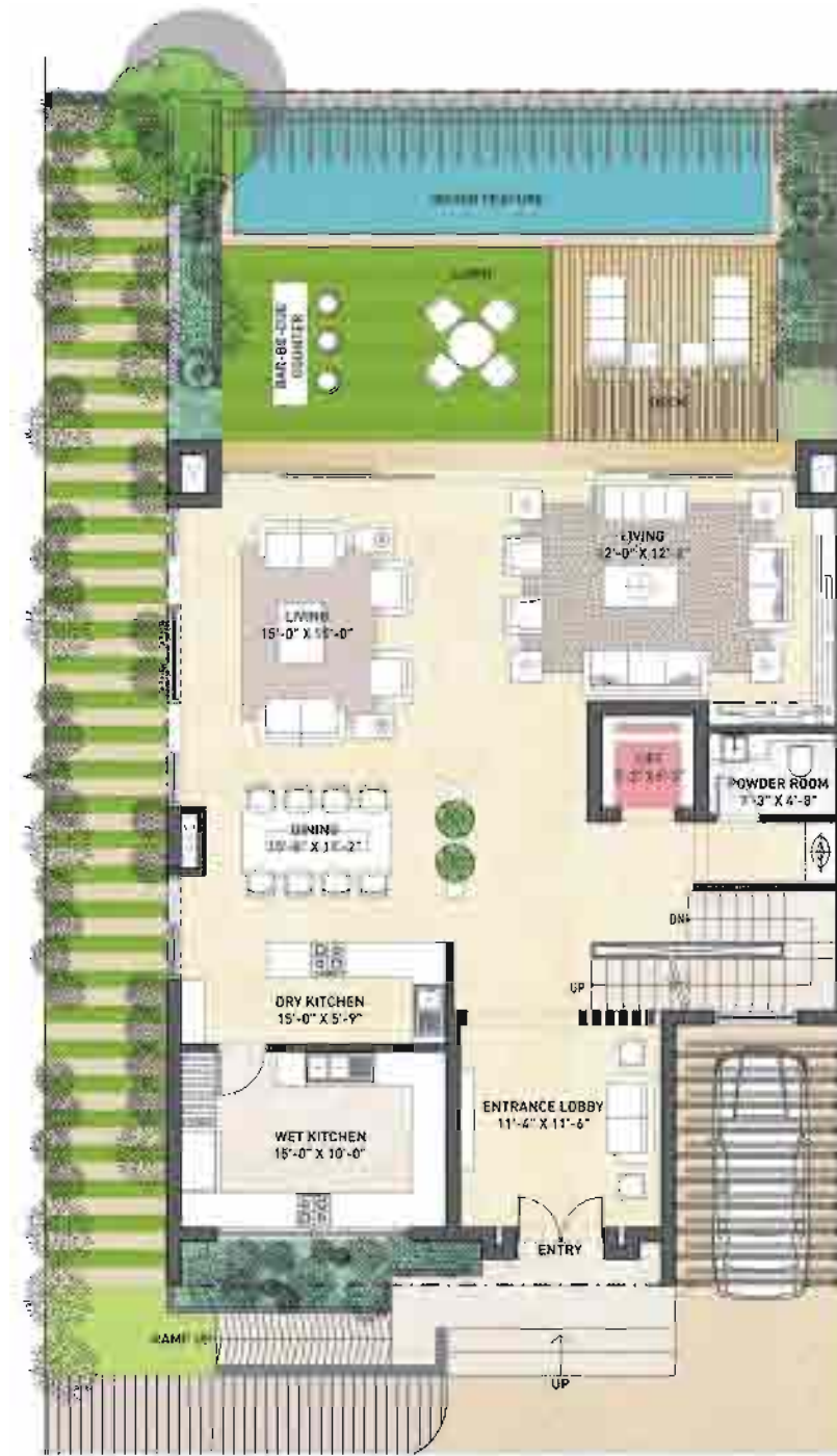
GROUND FLOOR (VILLA 1) Independent Villa, 5 BHK+S Saleable Area - 7,000 sq.ft.