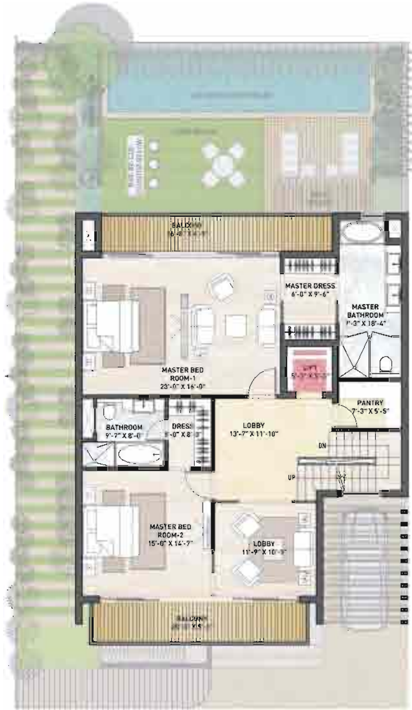
FIRST FLOOR (VILLA 1) Independent Villa, 5 BHK+S Saleable Area - 7,000 sq.ft.